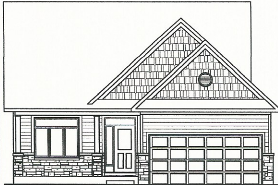
Front Elevation 'A'

Schedule 'C' Property known as: Lot 99 Dated: _____